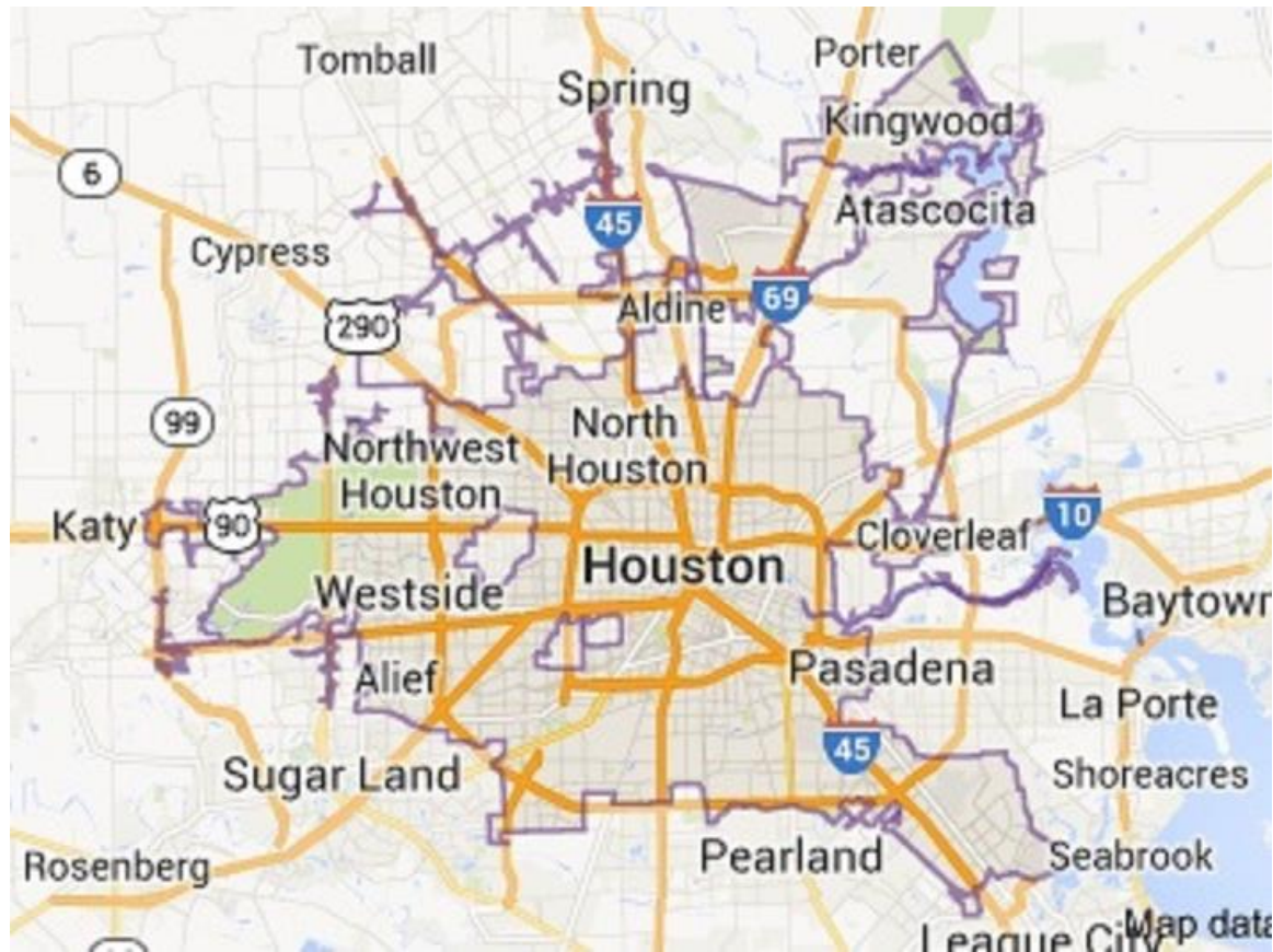
Map of Houston, TX.